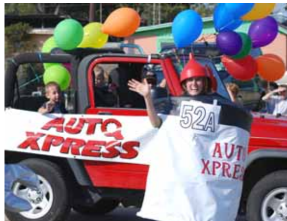
Guaranteed Auto Xpress entry in last year's parade garnered awards in two categories.

Volunteers are needed to assist with the parade lineup and awards ceremony.