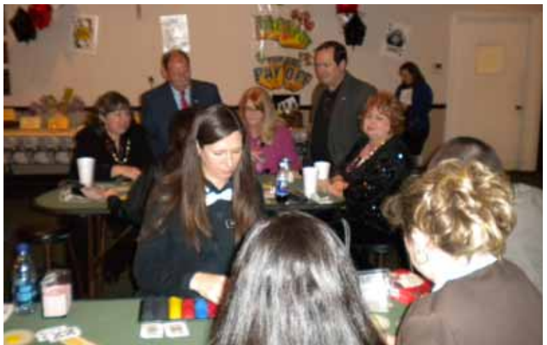
Guests are shown enjoying the evening's games.